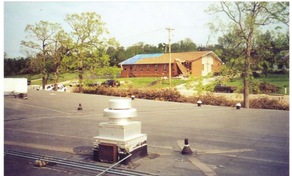
Church across the street had a wall collapse, along with roof edge and peak blow off.

2001 Company P.O. Box 2557 Waterbury, CT 06723-2557 1 (800) 537-7663