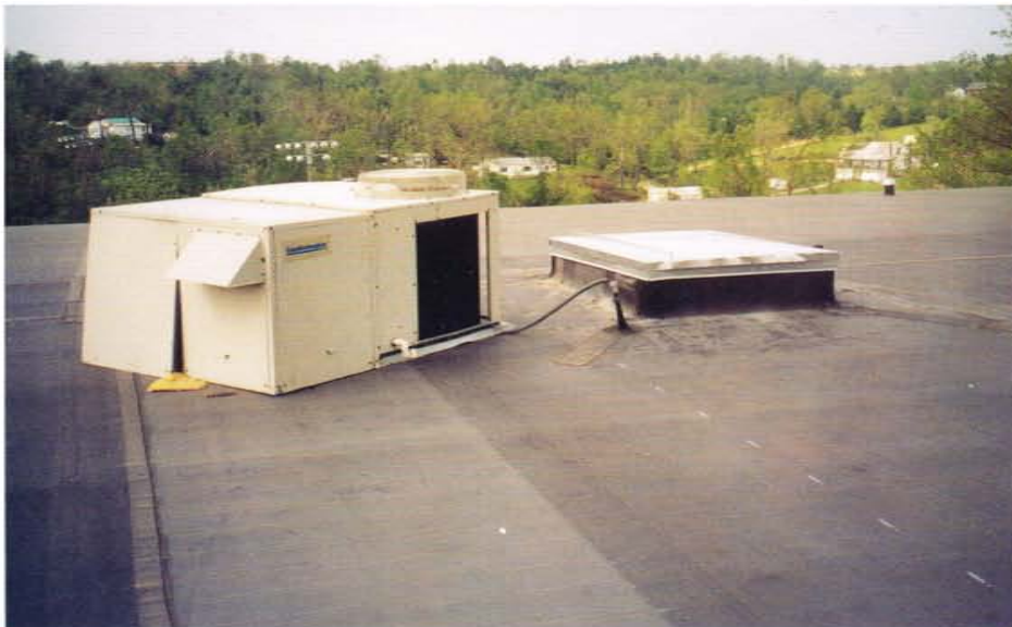
Tornado winds blew the HVAC unit off the curb as the 2001 Company system sucked down tight.